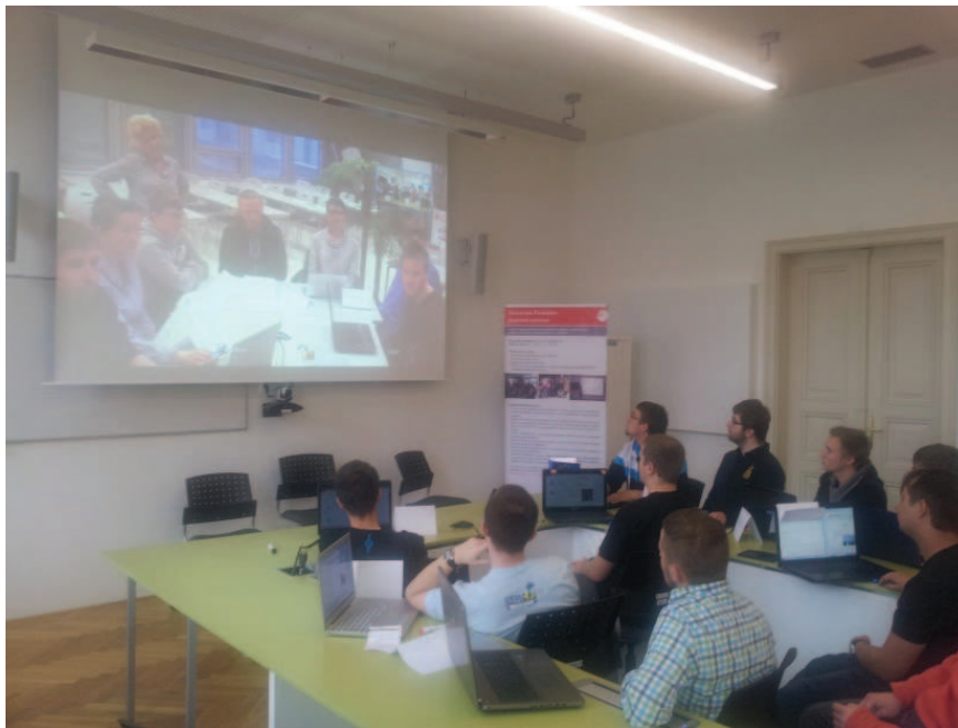
Fig.1. Example of small-sized groups in joint videoconferencing modules

The authors started the cooperation within the partner universities of HAAGA-HELIA, University of Applied sciences in Helsinki and the University of Pardubice in 2011 and later piloted the videoconferencing module concept in their standard ESP courses for IT students. The IT students involved in these joint courses worked in small sized groups and had approximately the same graduate profiles and language competences. The close cooperation of the two partner universities is absolutely essential for this project. The authors of this article have designed a videoconferencing module to help the students to discuss topics related to the major scope of their IT studies. The pilot project proved to be successful and was subsequently implemented into the mentioned Unicom project and extended to students of Economics on the Czech side.