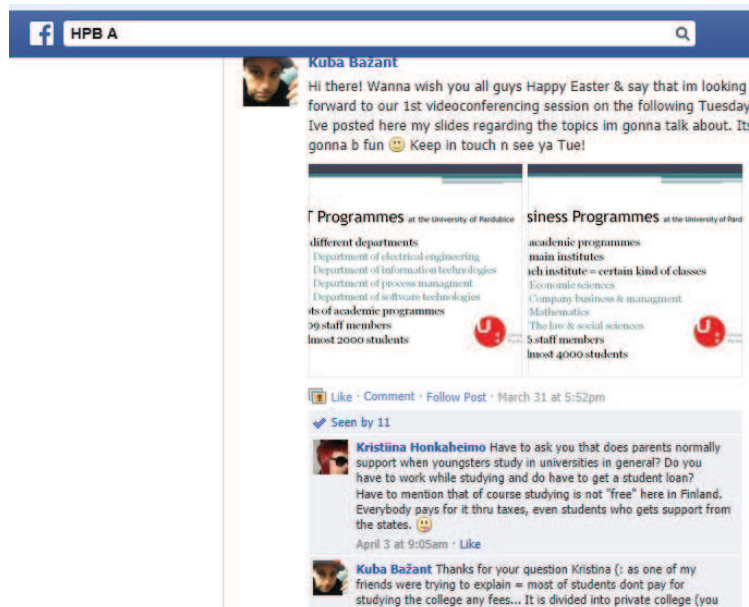
Fig.3. Sample Facebook screen shot of students' discussions

Both Czech and Finish students were invited to join the specifically set-up groups on the PARHEL (Pardubice/Helsinki) Facebook page via their Facebook accounts. They used the groups to post and review their presentations and communicate within the groups and with the teachers. Figure 3 shows that the set topics often initiated discussions between students beyond the given task and demonstrated the obvious shift from the teacher-centered to learner-centered approach.